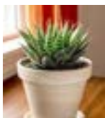
The Lace Aloe or Torch Plant (Aloe Aristata)

Remember to name your Lace Aloe and get a photograph to me as soon as possible so that your tutor plant can be entered. Maybe you will be claiming the prize for best overall improvement or for your plant having the most babies next year. Good luck everyone and remember, never underestimate the power of nature and connecting with it.