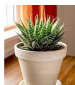
The Lace Aloe or Torch Plant (Aloe Aristata)

Remember to name your Lace Aloe and get a photograph to me as soon as possible so that your tutor plant can be entered. Maybe you will be claiming the prize for best overall improvement or for your plant having the most babies next year. Good luck everyone and remember, never underestimate the power of nature and connecting with it.