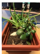
After... (with the aloe vera from last year's competition)